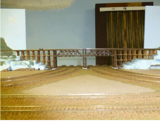
Module 1B yard throat with backboards

Another issue was the back board. After getting it mounted and painted, Mike didn't like the looks so the back board will be replaced with a new six feet section and taper trimmed to fit. At this time the square sides do not fit the scene. After the mountain scenery is completed we will need to decide what other scenes to add to the module & yards. NOTE: Any scenery on yard modules B1 & B2 cannot be any higher than the track guards otherwise the modules will not fit into the storage rack.