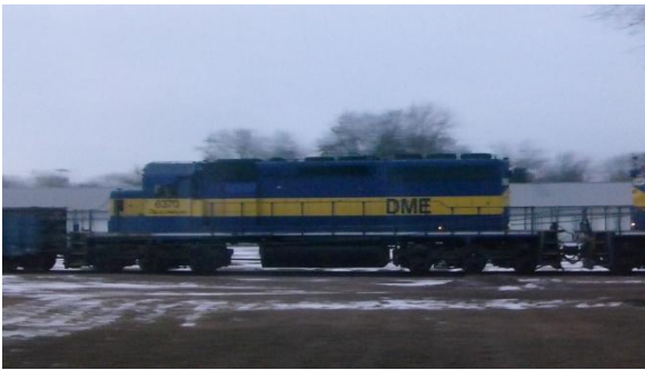
I finally caught a train going by