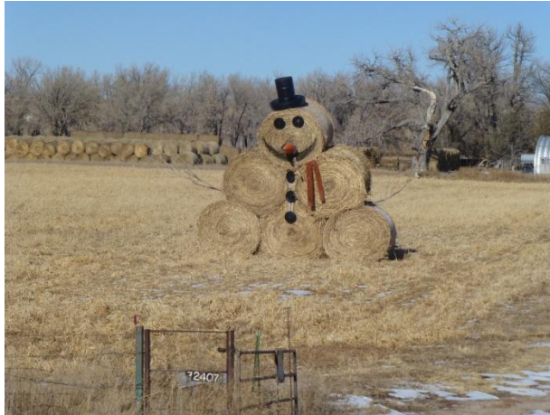
When you don't have enough snow