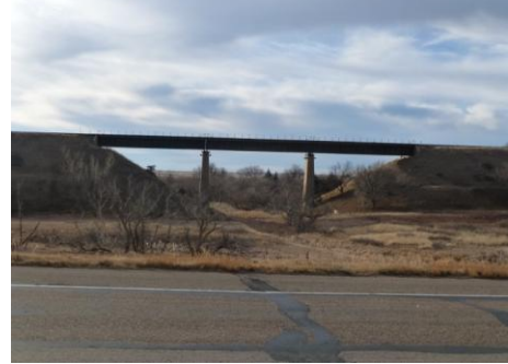
BNSF bridge along Hwy 34 in Nebraska