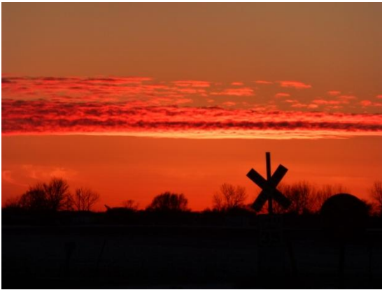
Sunset, Spencer, IA