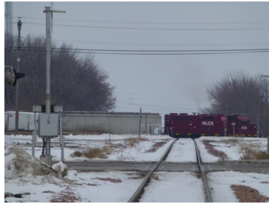
HLCCX 919 at crossing in Emmetsburg, IA