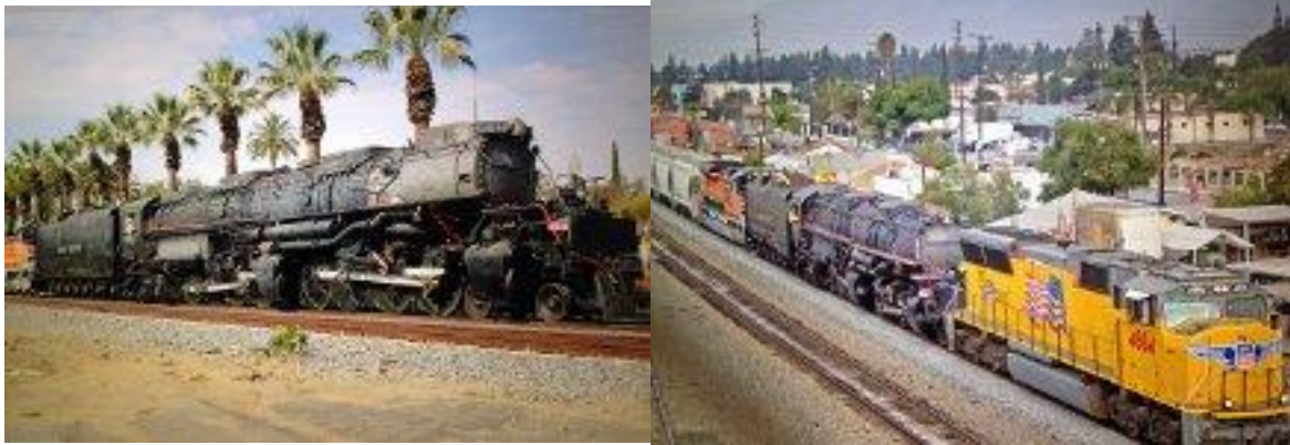
UP's 4014 is on the move

February 2014 RAILROADING SINCE OCTOBER 13, 1989