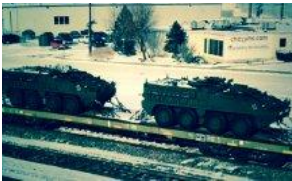
336 Strykers heading to Ft Carson.