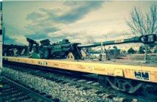
Artillery heading to Ft Carson.