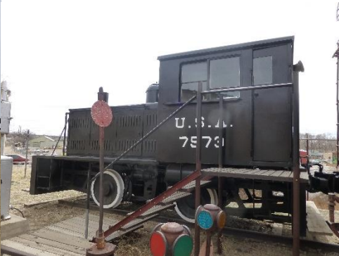
7973 loco at Otero Museum, La Junta