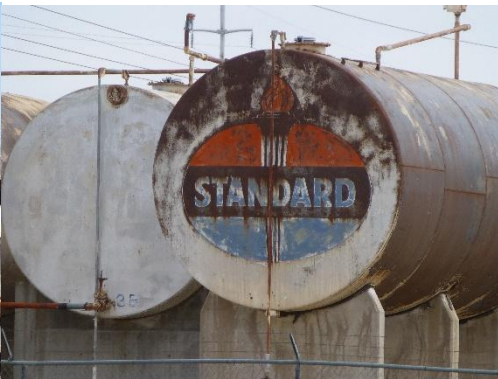
sign from yesteryear