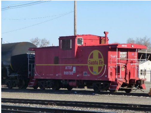
Caboose at Garden City, KS