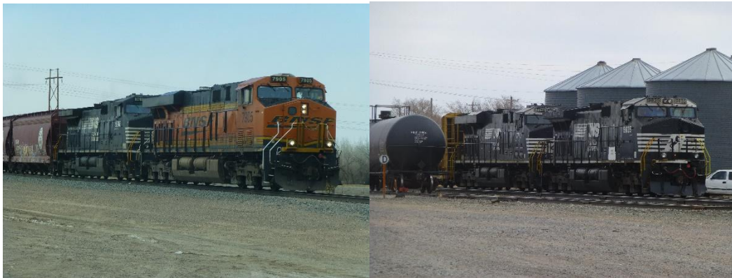
BNSF 7905 & NS 9618 at La Junta