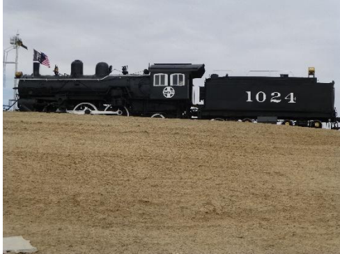
La Junta moved 1024 to a better location