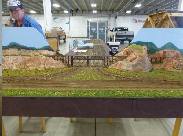
Lois's first bridge after modifications on module 1B