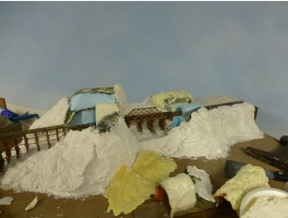
These two photos show the bridges during the installation of the Geo-Dessic foam scenery.