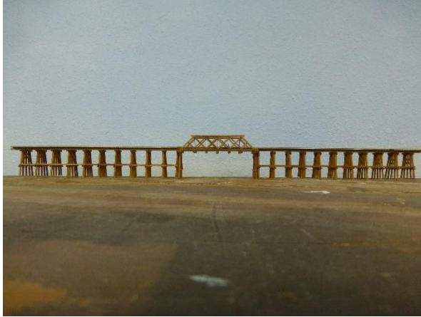
Lois's first bridge

The photos below show the first bridge before and after modifications to fit on the new MTL yard throat module. Some of the original bents had to be replaced so the longer bents could be added. The center bridge section of the original bridge was installed as a separate bridge between two tunnels.