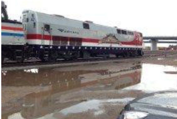
New AMTRAC Locomotive at Cheyenne