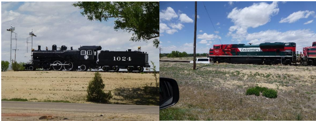
AT&SF 1024 in La Junta