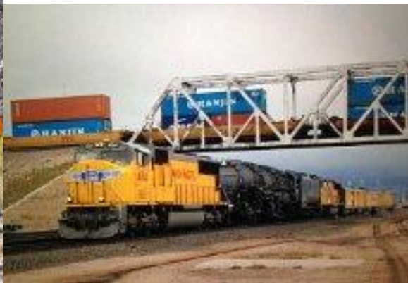
4014 entering Cheyenne, WY