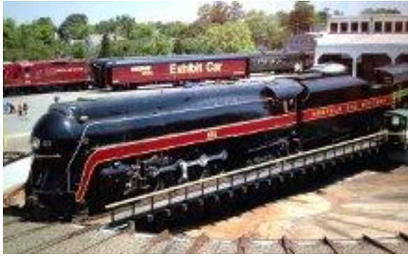
N&W J 611 on turntable