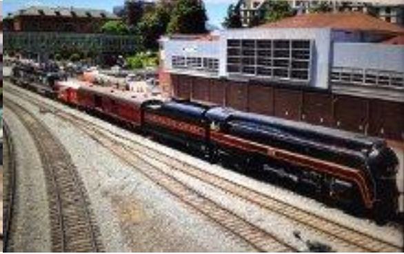
N&W J 611 being pushed onto main