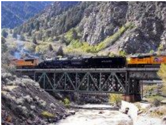
4014 crossing Devils Gate, Weber, UT

In the last few months we have all heard about the moving of UP 4014 back to Cheyenne for rebuilding to operational condition. We now have N&W J 611 moving to be refurbished and run. A great time for steam enthusiasts.