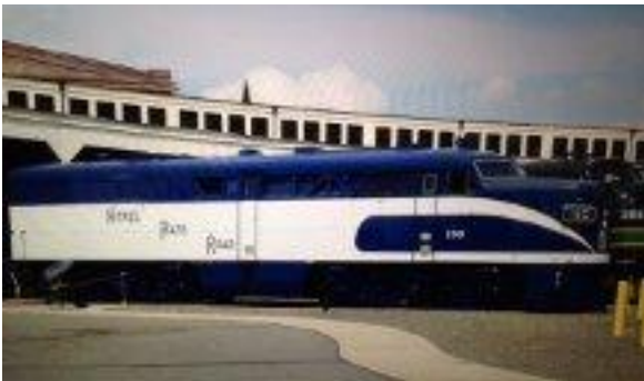
Nickel Plate Road PA-1