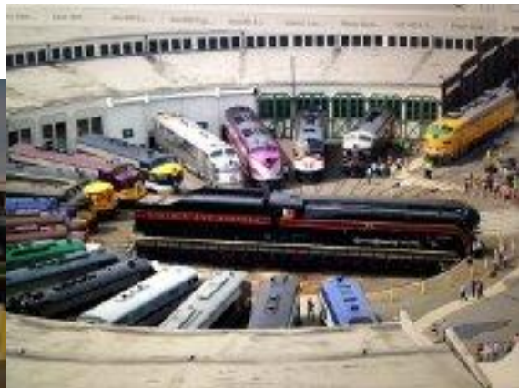
N&S 611 with other old liners