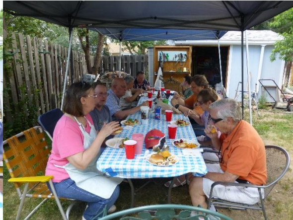
Another shot of the gang.

A good time was had by all even with the rain. There was a comment that this was the fourth BBQ and where did the time go!! It was determined that we had rain the first BBQ and now rain during the fourth BBQ so hopefully we don't have a forest fire during the next BBQ. Great time was had by all.