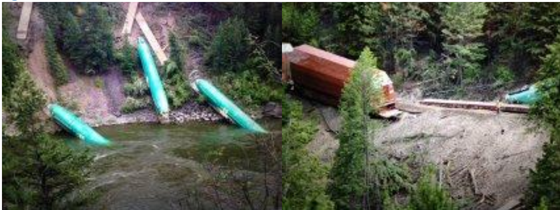
737's in the river in Montana.