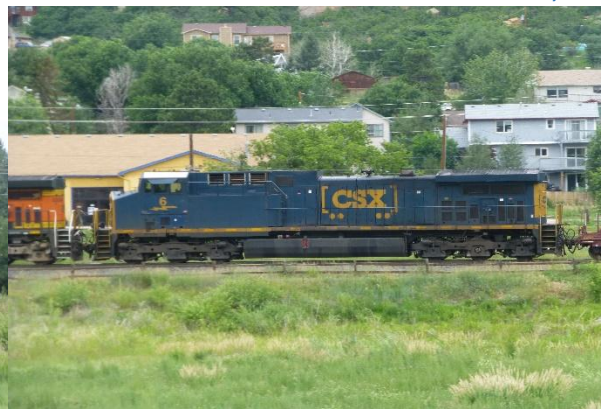
CSX 6 at Palmer Lake