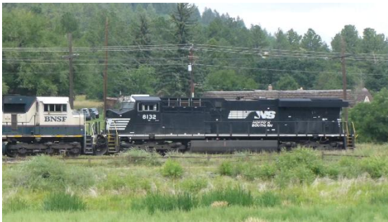
NS 8132 at Palmer Lake