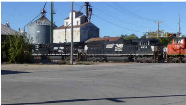
NS 6932 & 8126 in Cherokee, IA