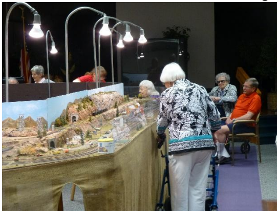
Some of our guests at Village at Skyline

Saturday turned out to be a very busy day, so glad we got the repairs done on Friday. We did see a lot of new faces as well as some of the familiar ones. A good time was had by all.