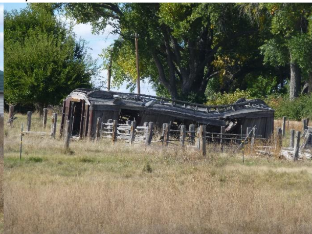
The remains of wood heavy weight passenger car