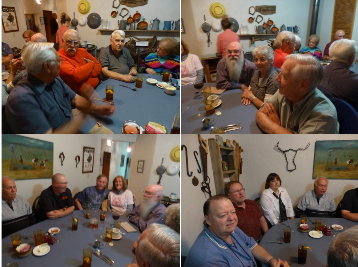
The gang at the dinner at Juniper Valley Ranch

A great time was had by all and everyone left with full bellies.