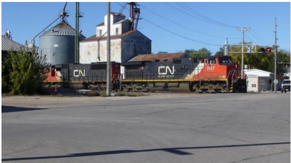
CN 2657 & 5760 in Cherokee, IA