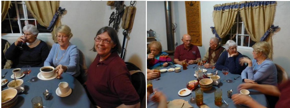
The attendees of the 25 th anniversary party at Juniper Valley Ranch