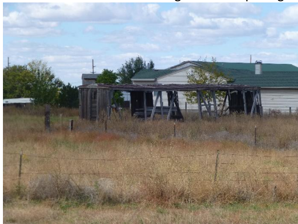
The wood frame of a wood box car

When Mary & I would travel to Iowa we always used the interstate system as it was faster. We decided this was getting boring so decided to take alternate routes to and from Iowa. We try and take a slightly different route each time we go back. Surprising what you can see on the back roads.