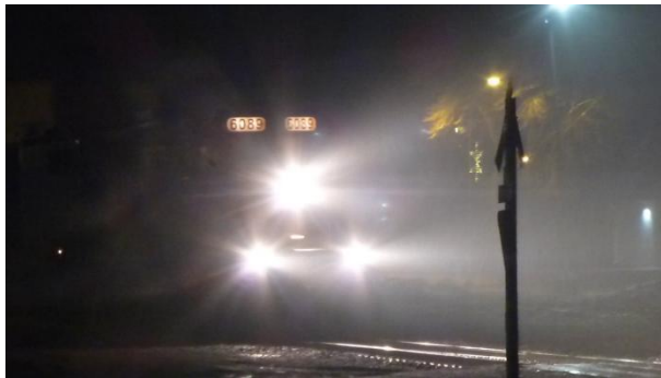
CP Rail 6089 west bound night run.