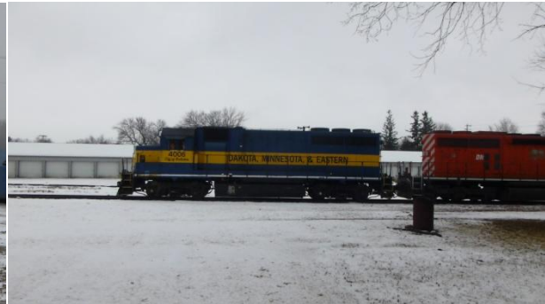
DM&E 4006 & CP Rail 6089.