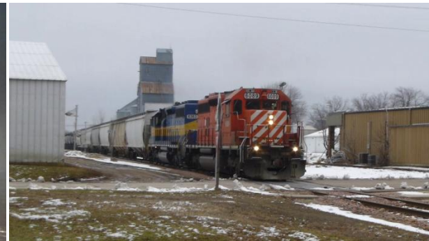
CP Rail 6089 & DM&E 6363 west bound day run.