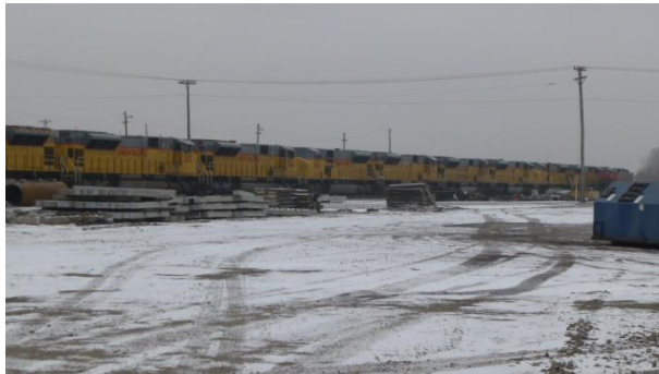
String of motive power at Missouri Valley, IA .