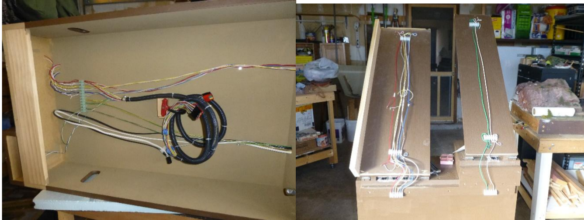
Wiring and connector harness