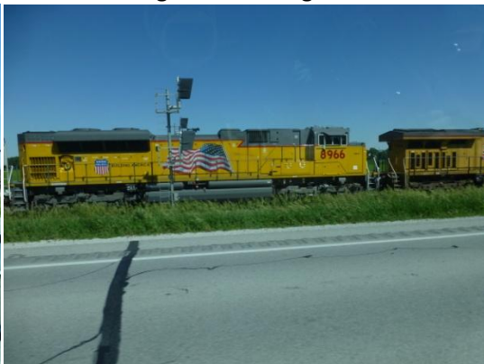
UP 8966 2 nd in leading a mixed freight