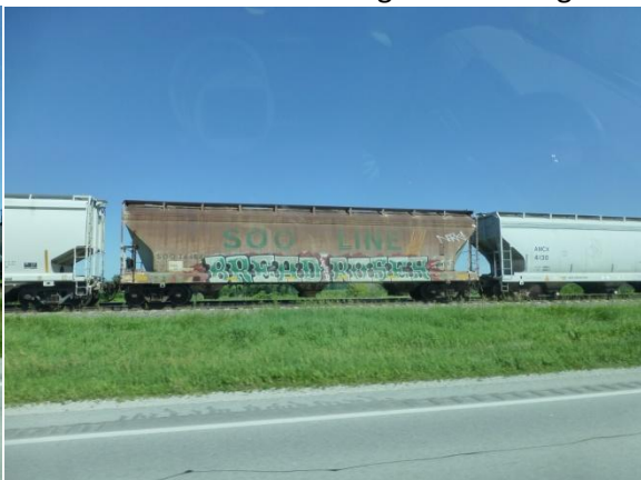
SOO LINE 74464 hopper