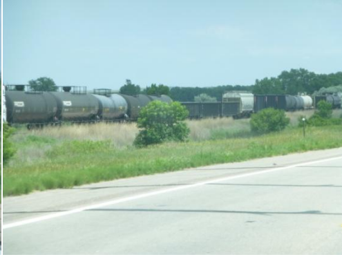
BNSF mixed freight along HWY 34 in NE