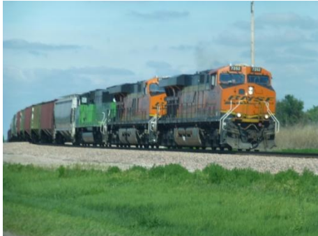
BNSF 7552 heading a mixed freight