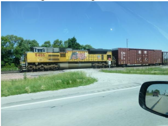
UP 8466 pusher