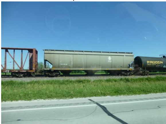
Illinois Central 799328 hopper