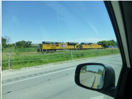
UP 8965 & 4625 heading a mixed freight