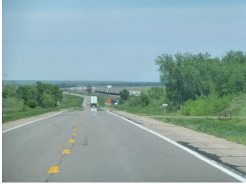
BNSF double stacks along HWY 34 in NE