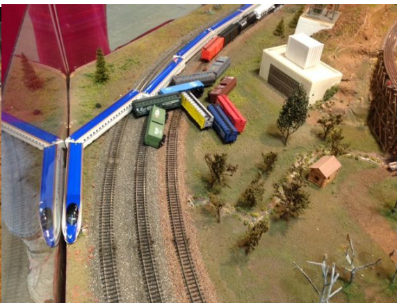
Bullet train meets derailed freight

It was great to see the Sweet Grass module again as it's been in storage since the club left the hanger or was it Janine Dr? We carry enough Plex-glass to add two additional 6' modules when setting up, so if you have or are working on one for future use let us know so we can get it into plans. The club has enough