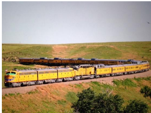
Cheyenne Rodeo Days Train