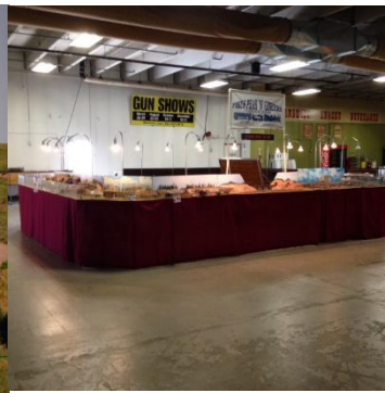
MTL at TECO 24