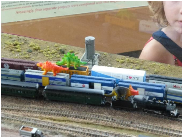
Dinosaurs train surfing at the Resource Center

September 2015 RAILROADING SINCE OCTOBER 13, 1989