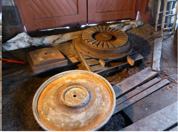
Bearing assembly for turntable