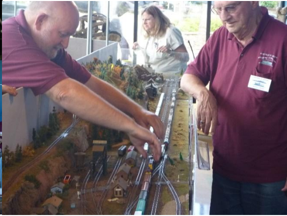
Track crew cleaning up after a derailment