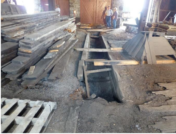
Locomotive pit in roundhouse