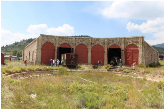
Como Roundhouse and turntable pit