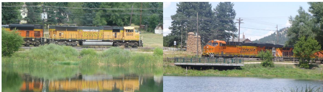
BNSF coal trains at Palmer Lake, SEE the WATER!!!!