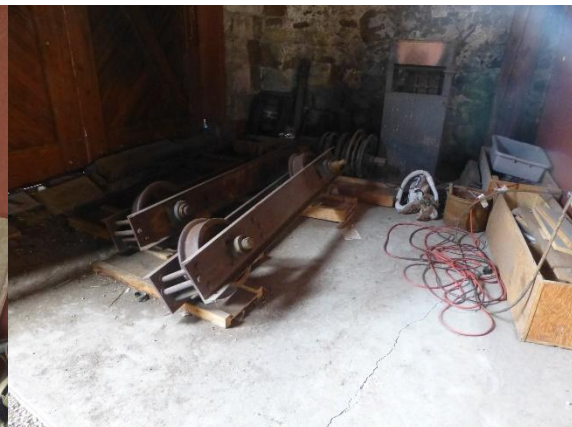
Wheel sets to be used on turntable