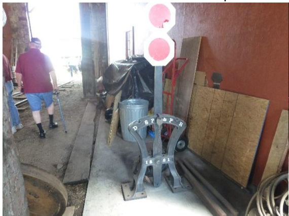
1881 DSP&P Harp type switch