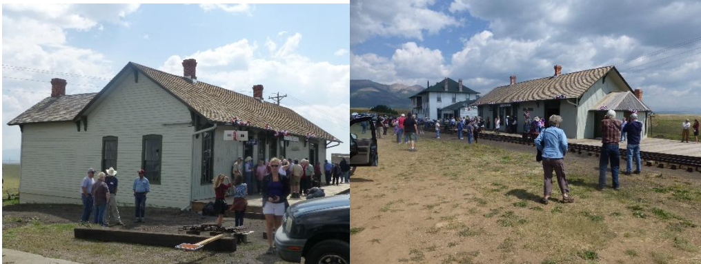
Two views of the restored Como Depot