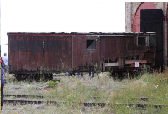
DSP&P boxcar #608