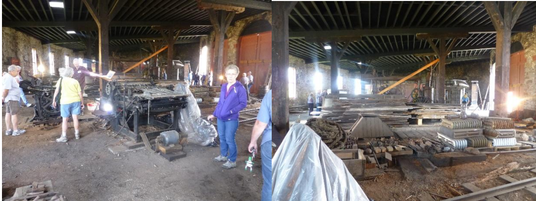
Interior views of the roundhouse, notice the printing presses, they still work

I talked to a few members of the Society about Alpine Tunnel and from what they said it will be worth a trip to the west