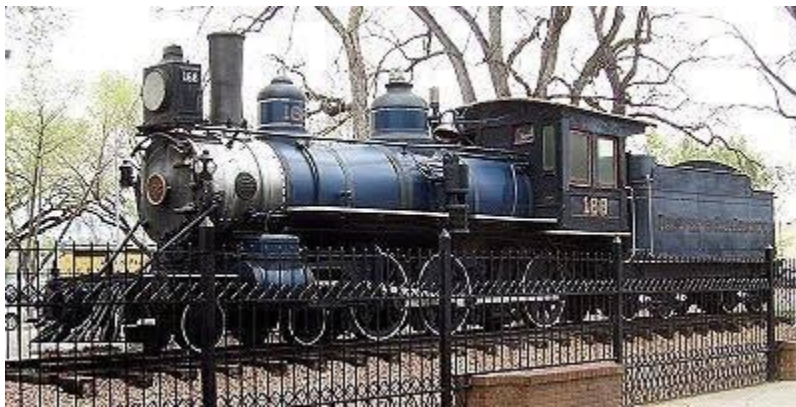
D&RGW 168 in Antlers Park

Celebrating 25 years of model railroading October 2015 RAILROADING SINCE OCTOBER 13, 1989