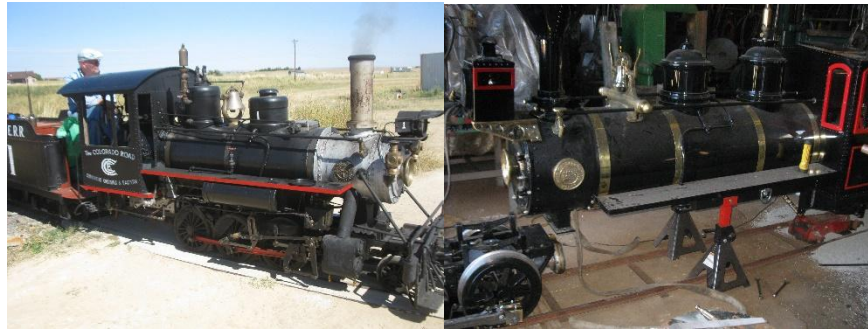
Steam loco of the Comanche Crossing & Eastern