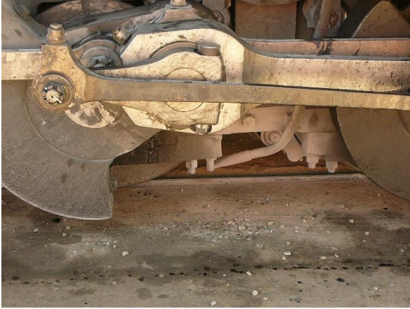
The replaced concentric rod that broke