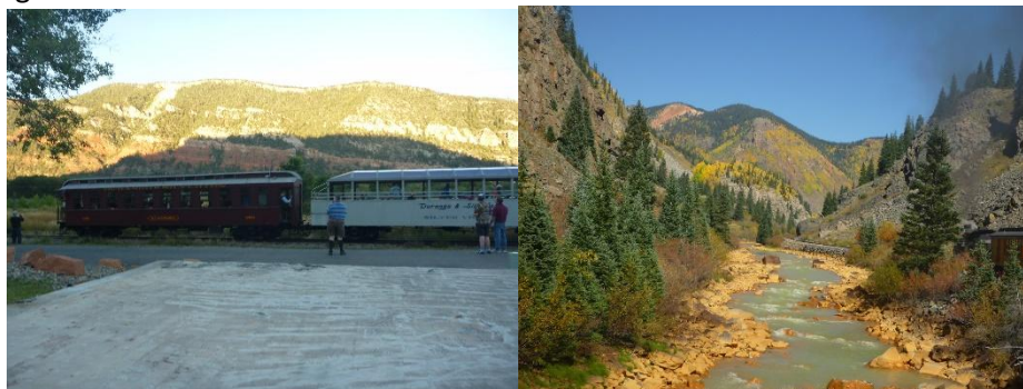
Watching the train Friday night

After a long day of train riding and photo shooting we met a classmate of mine and his wife and headed to the Palace restaurant for dinner. Glad we had reservations as the place was packed. Service was a little slow but gave us a chance to visit and relax. The meal was excellent so the wait was worth it.