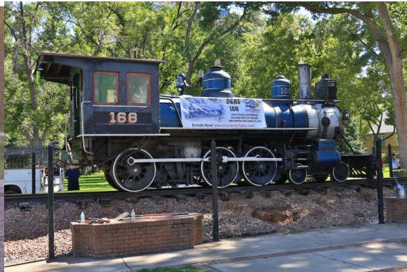
Sun on the rails, Emmetsburg, IA D&RG 168 day it was loaded