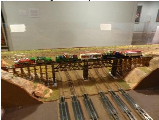
Christmas Train on yard bridge