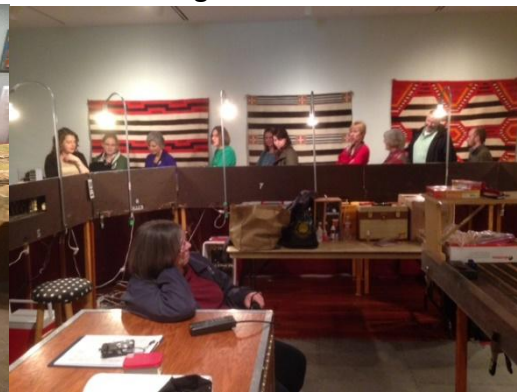
Some of our viewers